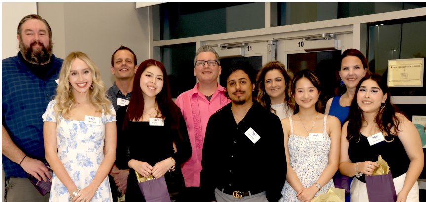
Winning teachers and students at the 2023 Students Choice Awards held at IMPACT Early College High School.