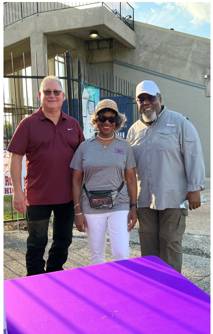
GCCISD Education Foundation board members promoting Alumni & Friends Campaign at the 2023 Graduation.